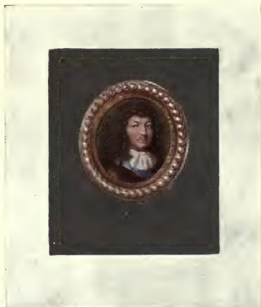
LOUIS XIV BY JEAN PETITOT, THE ELDER